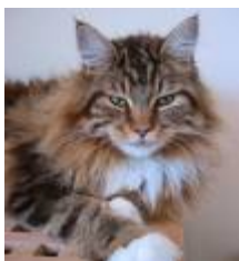
Left: A beautiful Maine Coon Cat