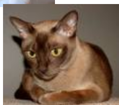
Below: A sable Burmese

People often generalize about cats. They think all cats are aloof or independent. As with dogs, there are many cat breeds and many distinct temperaments. Here are some of the most popular breeds and their general personality characteristics.