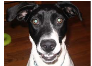
Pepper, a satisfied customer

We pride ourselves on never saying "no" to an existing client when they request our services. By letting us know in advance when you will need our services, we can continue that practice